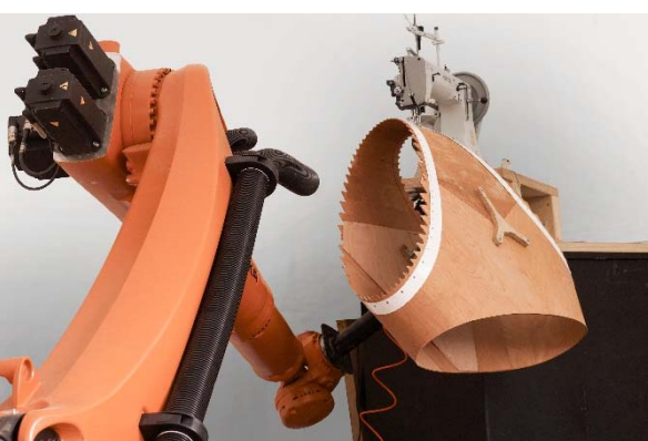
Robotic Sewing process of one segment. Three strips are held together by the robot's effector and lead through an industrial sewing machine to be permanently connected through stitches.