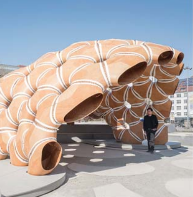
Development Process of the ICD/ITKE Research Pavilion 2015-16. Top: Completed Pavilion. Left: A section model of an irregular sea urchin (By Wolfgang Gerber, University of Tübingen). Middle: Robotic sewing. Right: Completed Pavilion.